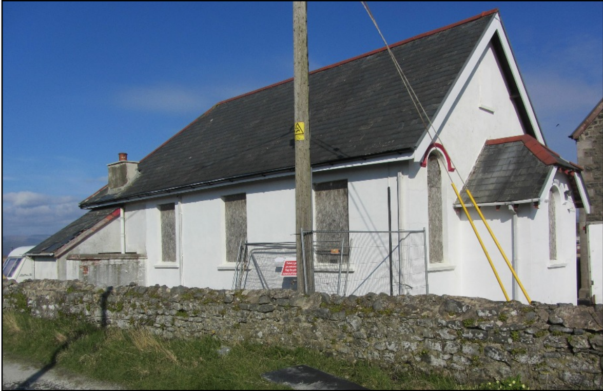
ABOVE The west wall of the Church. The porch main entrance is on the east side away from westerly winds.