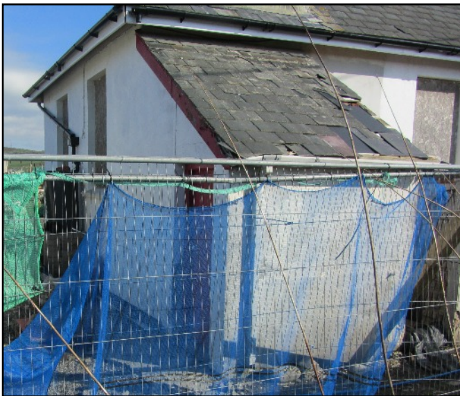
LEFT The north side of the Church with a lean-to and a rear door.