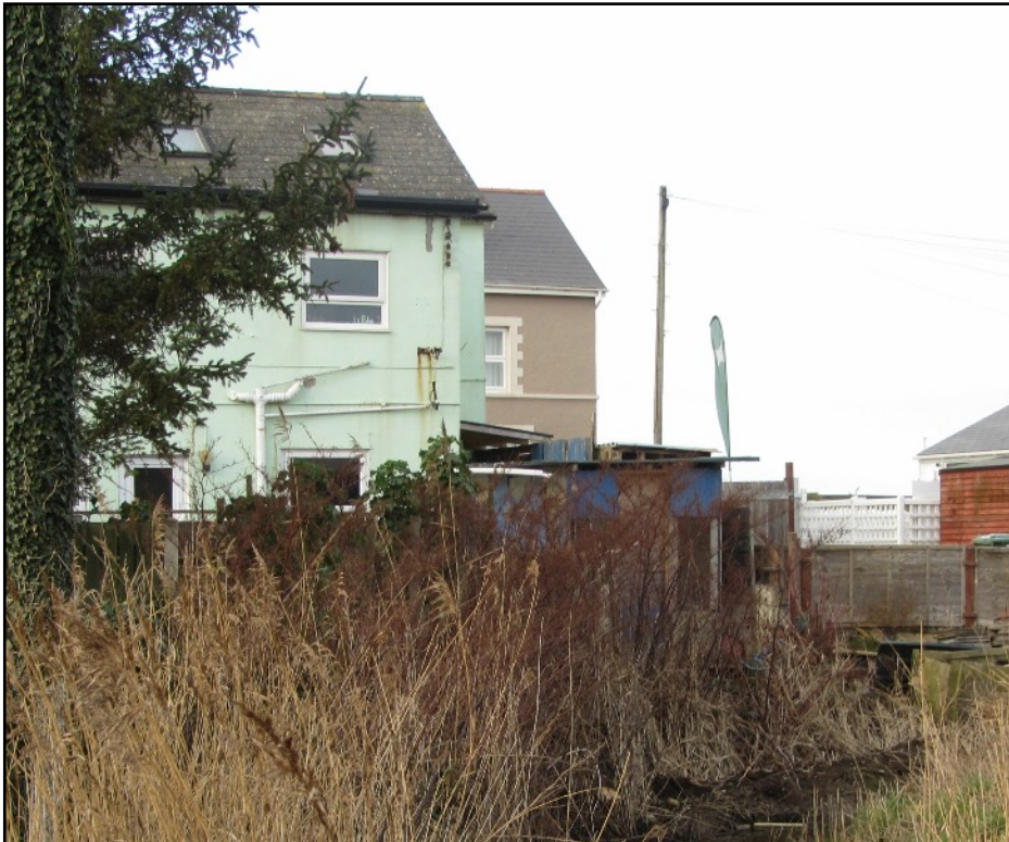
ABOVE The rear of the house in 2019. There are roof lights for its attic floor.

In 1967 Miss Fellowes advertised in a 'Guide to Borth' 'The Very Limit' with a furnished flat for four persons. This had a bathrooms and hot and cold water, and the kitchen was all electric. This was accommodation in her own house.