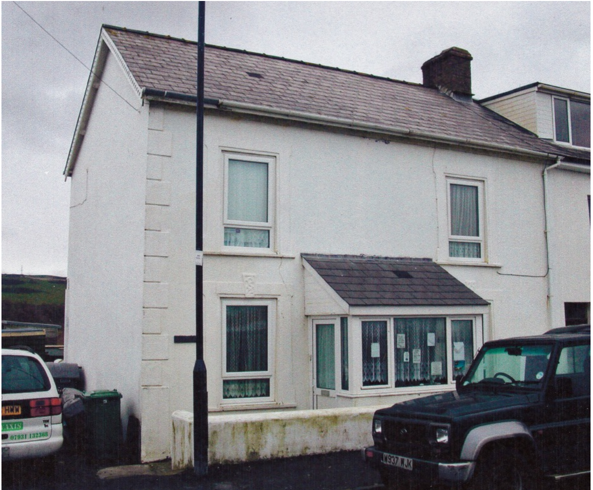
ABOVE The house in 2009. /RIGHT It is the northernmost of a terrace of three houses. Photograph taken in 2015.