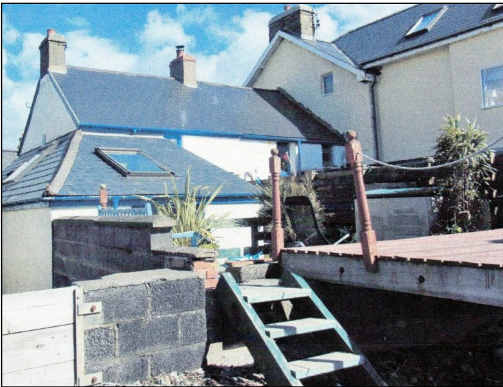
The cottage from the beach in 2015. The extension with the front door continues out into the yard and under a hipped roof. It is lit by a roof lights. On the south side of the yard is a tall wall with an outbuilding alongside which gives privacy to the yard. A platform extending from a wall at the rear of the yard gives a seating area with a view out to sea, and this may also protect the back from the sea during storms.