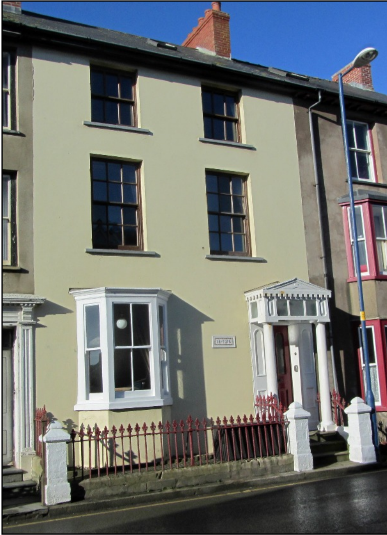
LEFT Neptune in Spring 2017. Owing to the height of the building and the width of the street it had to be photographed at an angle.

Neptune stands at the smart end of the High Street, close to the railway station which opened to passengers in 1863, the huge Cambrian Hotel, later Pantyfedwen, (now gone) and the Cambrian Terrace completed by 1870. It was also close to the place where the main street runs alongside the beach with no buildings in the way, (now with a promenade), and old postcards show that this area had bathing huts and was popular with visitors.