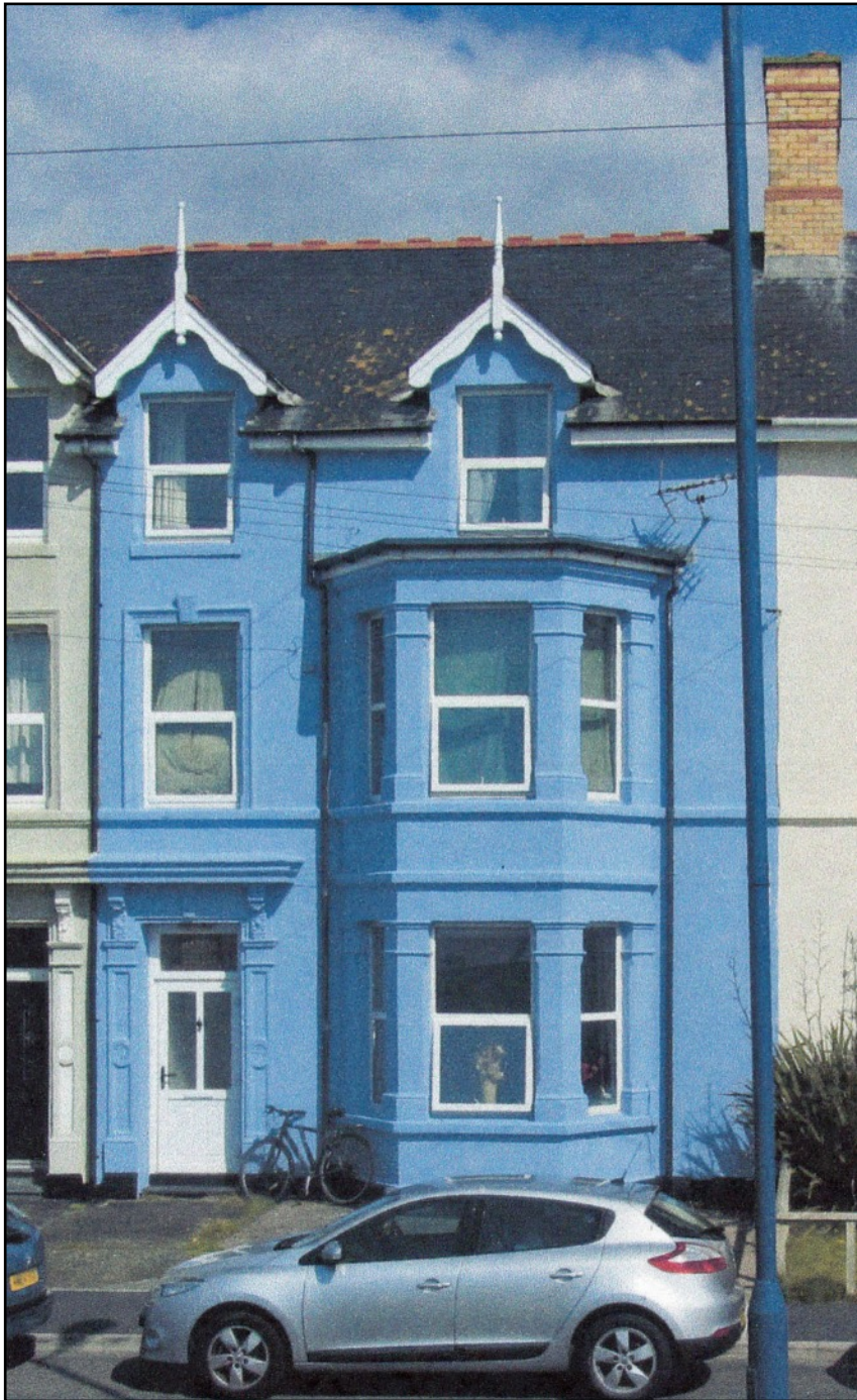
LEFT The house in 2015.