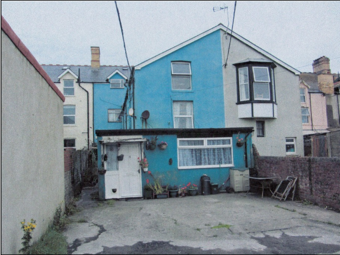
ABOVE Marine Court from the lane at the rear. There is a narrow passage to the main house, and both a two storey and single storey extension. This has the back door. The dormer window does not match those in the front of the house as it has plain barge boards and no finial.