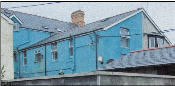
ABOVE The extension from the south side shows plenty of rooms. There are roof lights for the attic floor of the house, and another one for the extension. All the windows are modern.

For the early history of the ground on which the house is built and details of the architecture of the terrace please look at 'North Parade'.