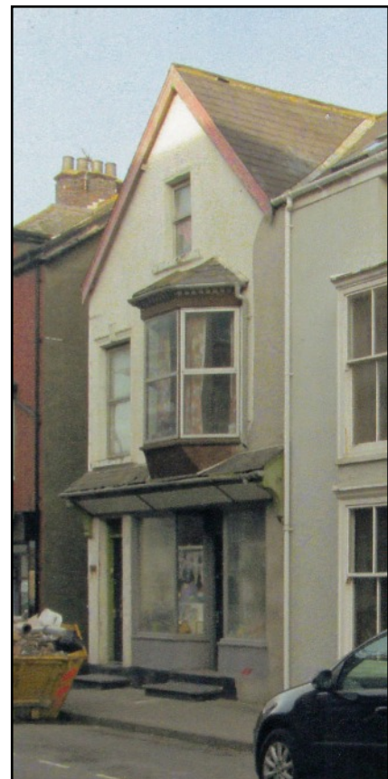
ABOVE Manchester House in 2013. It has since begun to be renovated.

The ground floor has a shop front with a private front door to the house on the northern side. The shop has its own door. In 2013 it was described as a disused retail shop plus a living room, kitchen, six bedrooms, a small bathroom, garage and cellar (Advertisement by Aled Ellis) At the rear is a generous extension along the north side of its site.