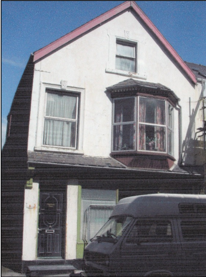
LEFT The building in 2009.

On the east side of the northern end of the High Street. A late nineteenth century shop and house for a grocer. It was built in front of what had been Wellington Place, a terrace of old cottages set back from the street and it would absorb one of these.