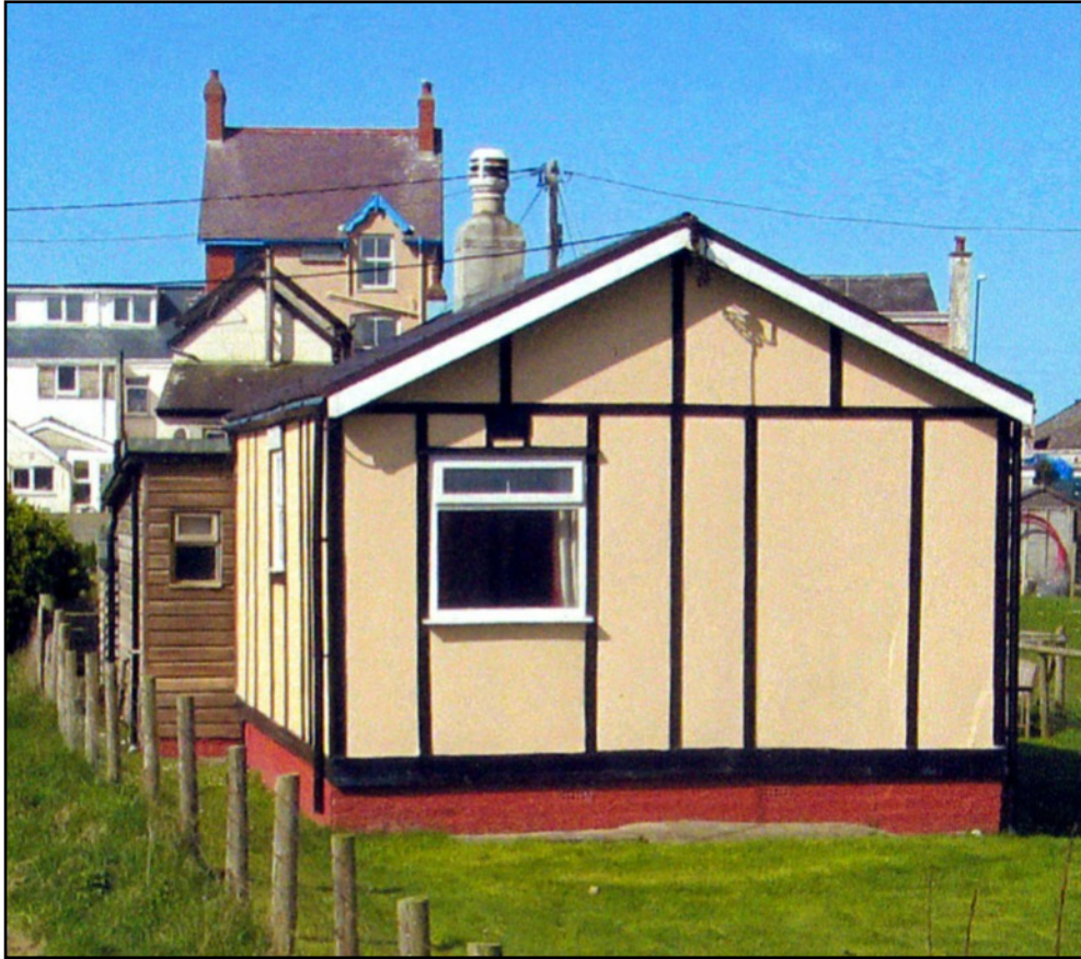
Llinos from the east.

This is a single storey house at some distance behind Morawel and Bay View and not far from the ditch which was once a brook.