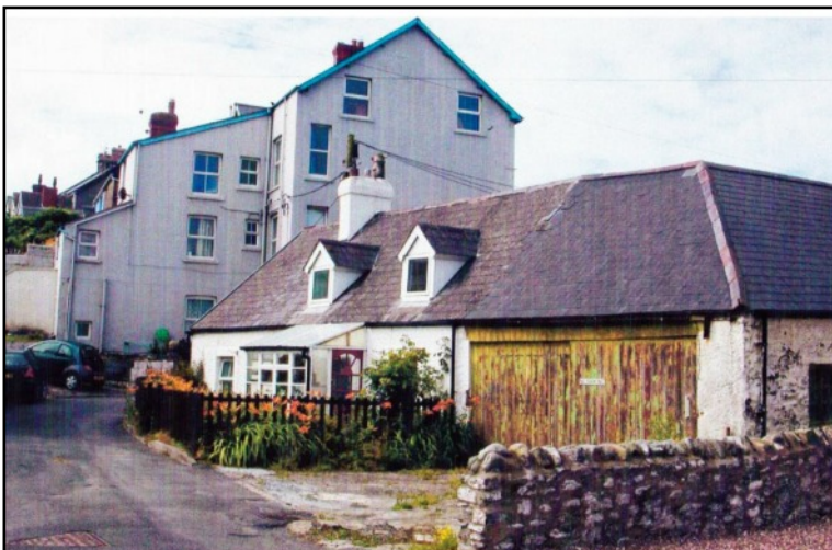
The garage alongside was the side of the next door cottage. (2012)

Gull Cottage is under a gable roof parallel with the lane. The position of the chimney indicates that it has an extension built on the south end. The front door today is enclosed in a porch with a large area of window and a translucent sloping roof. Formerly the front door would be nearly in the centre of the old cottage, the room on the south with the chimney being its living room/kitchen was wider than the room on the other side of the front door. Once there would have been a passage from the front door between them. Today the front door opens into a living room.