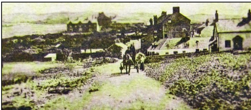
Lôn Glan-y-môr in 1915, our earliest glimpse of the cottage. It had its dormer windows and the extension on the south end of the roof beyond the chimney.

The name Gull Cottage came with a couple living there sometime after this. Today there are three bedrooms in the loft.