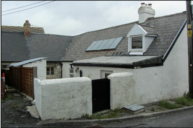
The yard of Gull Cottage in 2016. It is alongside the Lôn Glan-y-môr which turns the corner round the cottage. The nearly flat roofed extension contains a bathroom and kitchen and a back door into the yard.

The cottage has an upper floor, lit by two dormer windows at the front and one at the back in the new section. The cottage walls are rubble stone and are rendered. Inside an outer wall edges the stairs at the rear of the living room and this shows no rounded beach stones. The windows are modern. The two ground floor front windows have a smooth rendered frame. Some negotiations with a Garage Cottage owner have allowed a yard large enough for an extension at the rear of Gull Cottage.