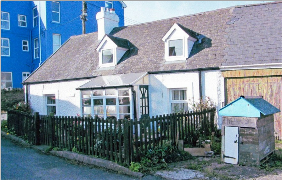
Gull Cottage in 2012

Formerly called Hollyhock Cottage. Part of an L shape terrace of four cottages between the road to Clarach and the Lôn Glan-y-môr at the far southern end of Morfa Borth. The cottages were estate owned but sold off by 1910. Today only three are inhabited, Craigfryn rebuilt tall, Drake Cottage, and Gull Cottage alongside the Lôn Glan-y-môr (Sea bank lane - possibly Marsh bank lane).