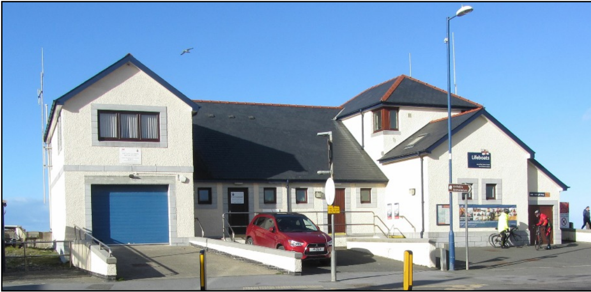
ABOVE The building from the road in 2019. The coastguard has the part on the left.