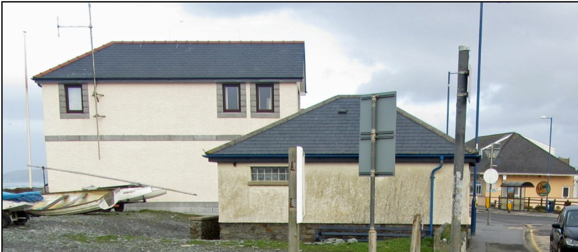
ABOVE The south face of the building with the public conveniences in the foreground. The architect has brought life into an otherwise plain wall with an inlaid stone line and matching grey stones round the windows.

There had been two previous buildings for the lifeboat , a timber one built in 1966 when there was no slipway and the D-class inshore lifeboats had to be carried down to the sea.