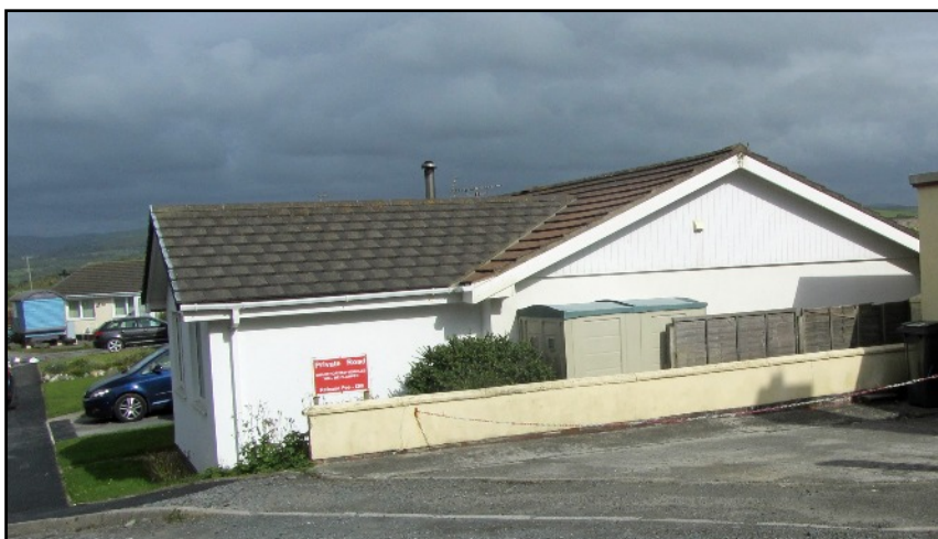
ABOVE Bungalow Number One is very close to the boundary of the Bryngwyn house.

In 1971 it would have been the owner of Bryngwyn who sold his garden and the plot of land to the north to the builder to enable the Clos to be built. Because this land was down off the shingle bank it was reclaimed marsh and bungalows were a sensible choice as heavy buildings would tend to sink. As it was, some 'raft' or similar foundation would have been used to spread their weight on the soft ground.