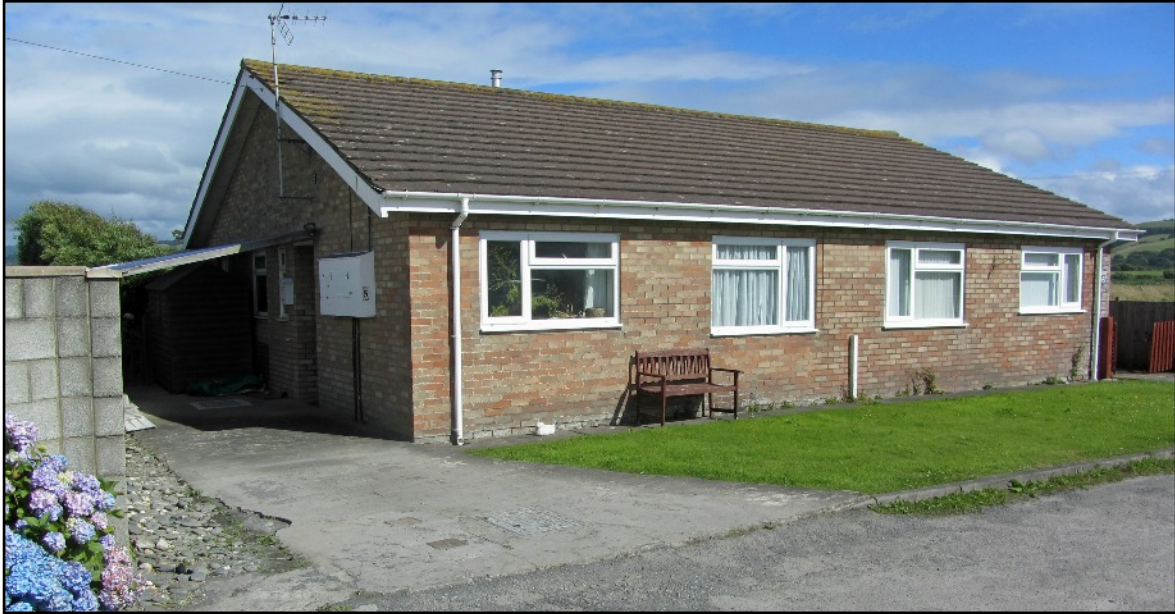
NUMBER SIX is alongside Jude at the east side of the close.