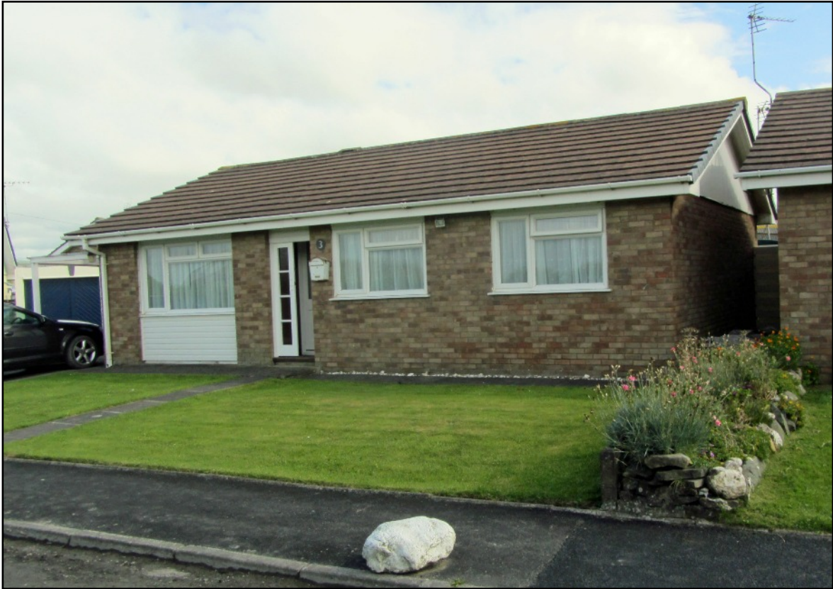
ABOVE This is Bendith which has three bedrooms.