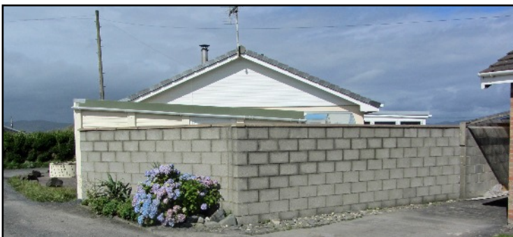
ABOVE and LEFT is JUDE which is built at an angle where the close turns right.