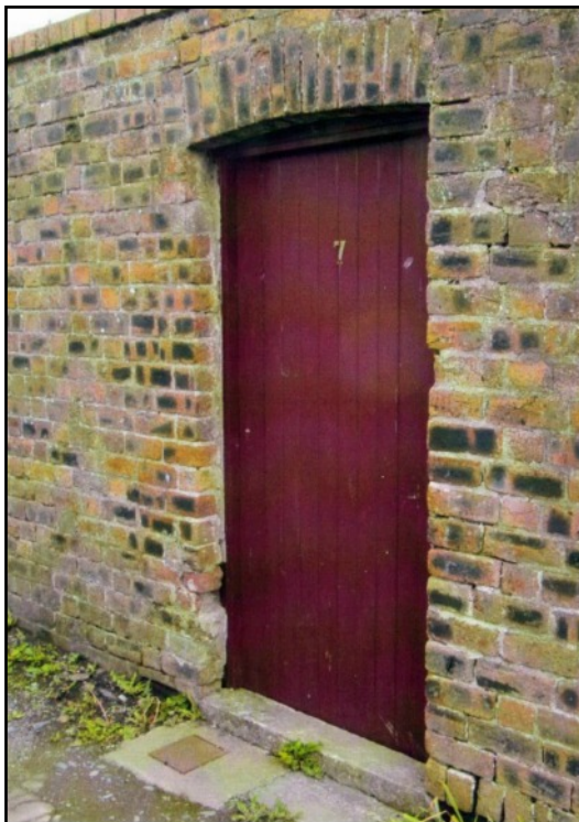
BELOW The rear yard still has its gate in the original wall opening out on to the lane behind the houses.

realised.” By 1888 the hotel and Terrace houses were all mortgaged, and the mortgagees put them up for sale on September 20th 1888. They were in separate lots so each house could have a new owner. A coloured Plan in the Borth Railway Museum shows the estate. There was a ‘garden’ for the house behind The Terrace which it still had in 1910.