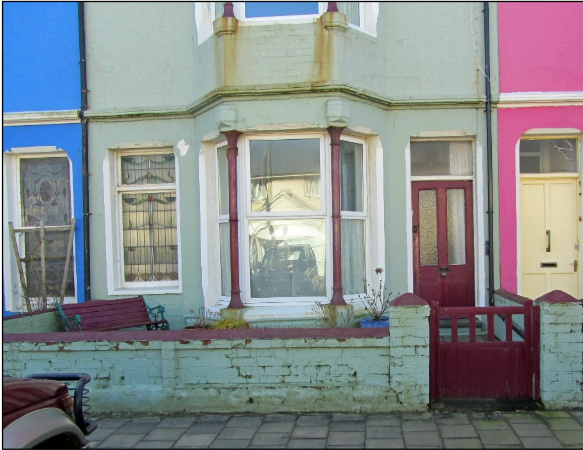
ABOVE The house in 2016. It had a handsome stained glass window in its ground floor front sitting room.