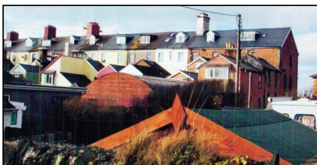
LEFT The rear in 2016. Its dormer window is a good size and there are roof lights for the attic. The chimney was shared with Bibury. There are two extensions at the back, the taller one has a brick wall under its gabled roof.