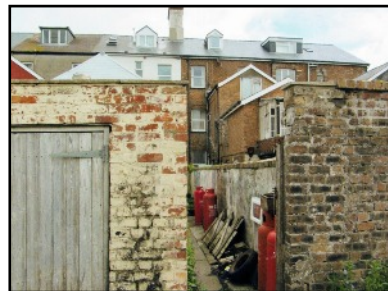
LEFT The yard of Number 3 in 2014. The rear of this house was rendered white. In the foreground was the brick out-building against the wall that all the houses had. It had a gable roof at right angles to the main house and was shared with Number 4..