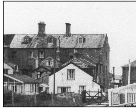
Above was the rear of the house in the 1960s with its original chimney and tiny dormer window. Seen behind a Church Street bungalow.