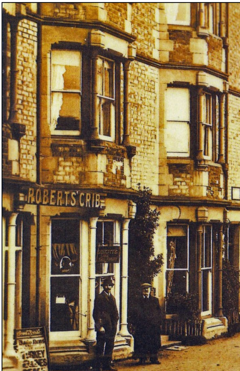
A detail from a postcard.