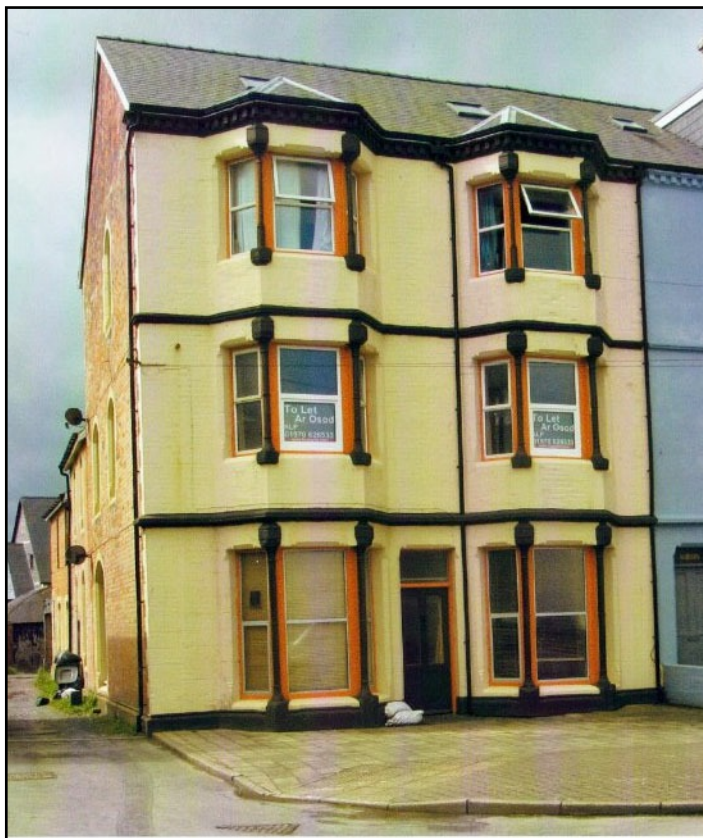
Rutland House in 2010