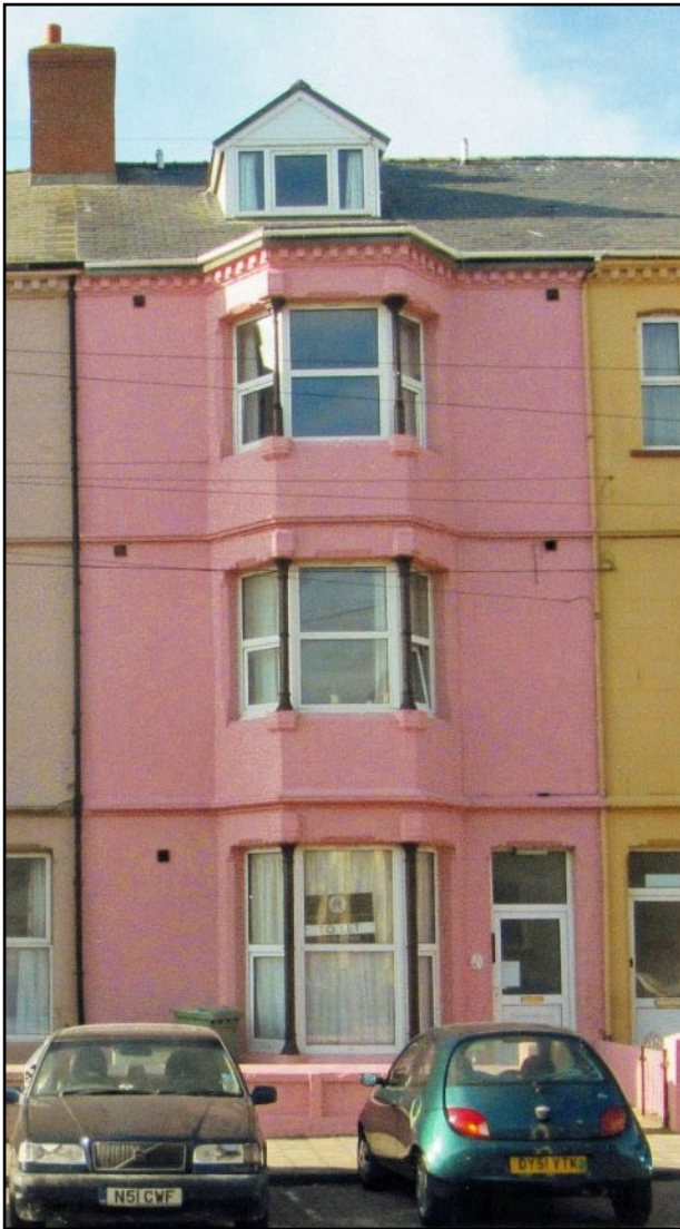
The house in 2014. It shares a slab brick chimney with Number 10. A dormer window in the roof has been added, and there was originally no front garden, the front door opened directly on to the street.