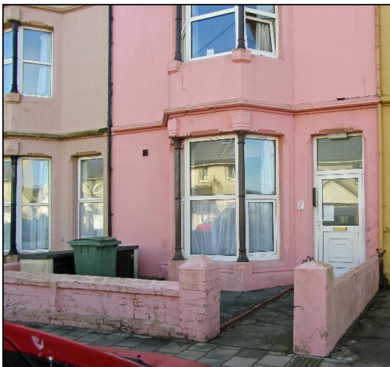
The house in 2016. Some of the carving of the sandstone dressings of this house has survived quite well, now under the rendering. The front door is modern.

framing and supporting the bay windows are iron, and in the Gothic style. The houses were probably owned by the Railway Company to begin with, and let to tenants. Number 11 has only a tiny narrow yard. There was not room at the rear for the longer yard with outbuildings given to Numbers 1 to 9. Number 11 has a narrow yard that can open on to the tiny passage that connects to the back yard of the large corner house, formerly Hafran, formerly the Grand Hotel, formerly Taliesin House. This was because the building, now the Premier Stores and house beside it (formerly called Garibaldi and Robert's Stores) were already there when the Terrace was built. However the house had a garden across the little lane at the back like the other houses in the Terrace.