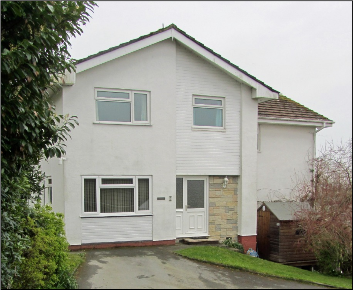
ABOVE The main entrance, showing the varied surfaces which have been used and the red ground line. BELOW Looking up from the main road this is a sizeable house.