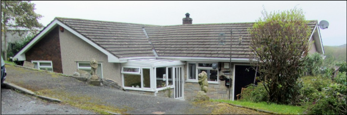
ABOVE AND BELOW Brder, Number 4