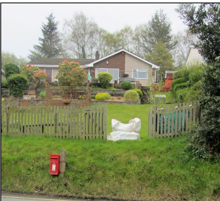
LEFT This bungalow manages to make a successful hillside garden, this is the view from the main road.