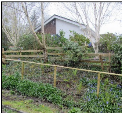
RIGHT and BELOW Gwaun Cwm Brwynog, Number 2 is perched on the hillside on the other side of the lane.