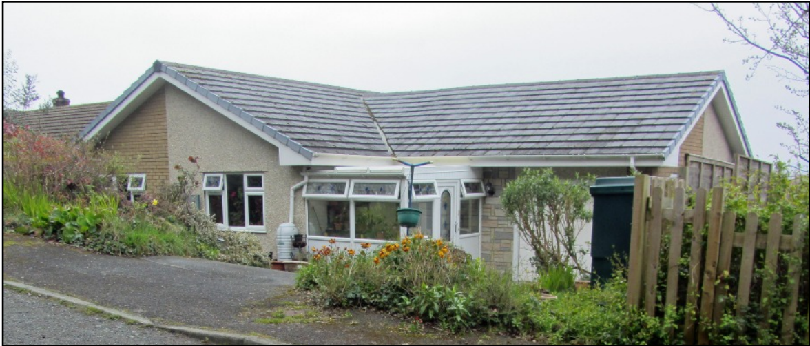
ABOVE Sea Drift, Number 3