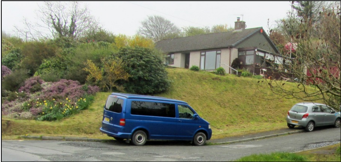
ABOVE Bungalow Number 1 is on the hillside on the east side of the lane, with heather on the bank leading down to the main road.

It is not clear yet whether the Richards family of GlanLerry Farm had these homes built and then sold them, or that they sold that part of their Cau Wern field to a developer. The bungalows are very similar suggesting they were built about the same time. The walls are often rendered, but sometimes there are glimpses of darkish red brick.