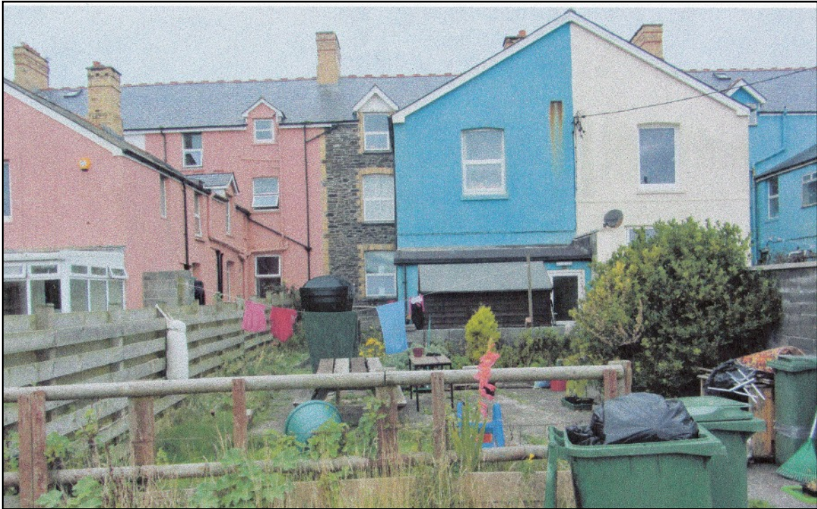
The rear of the house in 2015 from the lane or track behind the terrace.