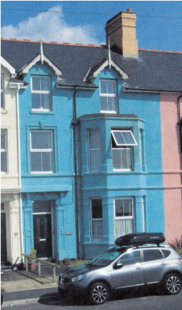
LEFT Bardsey in 2015.

Today the name of the house is often simply 'Bardsey' instead of 'Bardsey View', however Bardsey Island can sometimes be seen 80 miles away across the bay. This is an Englishman's name for the house as Bardsey is 'the island of the bards' in English but Ynys Enlli in Welsh.