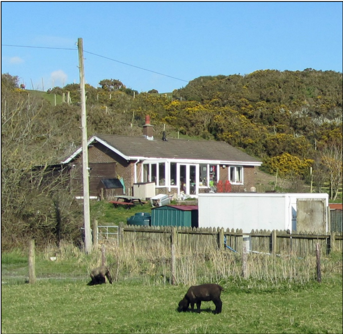
The bungalow in spring 2019.

This stands on the south face of the rising hillside of Ynys Fergi.